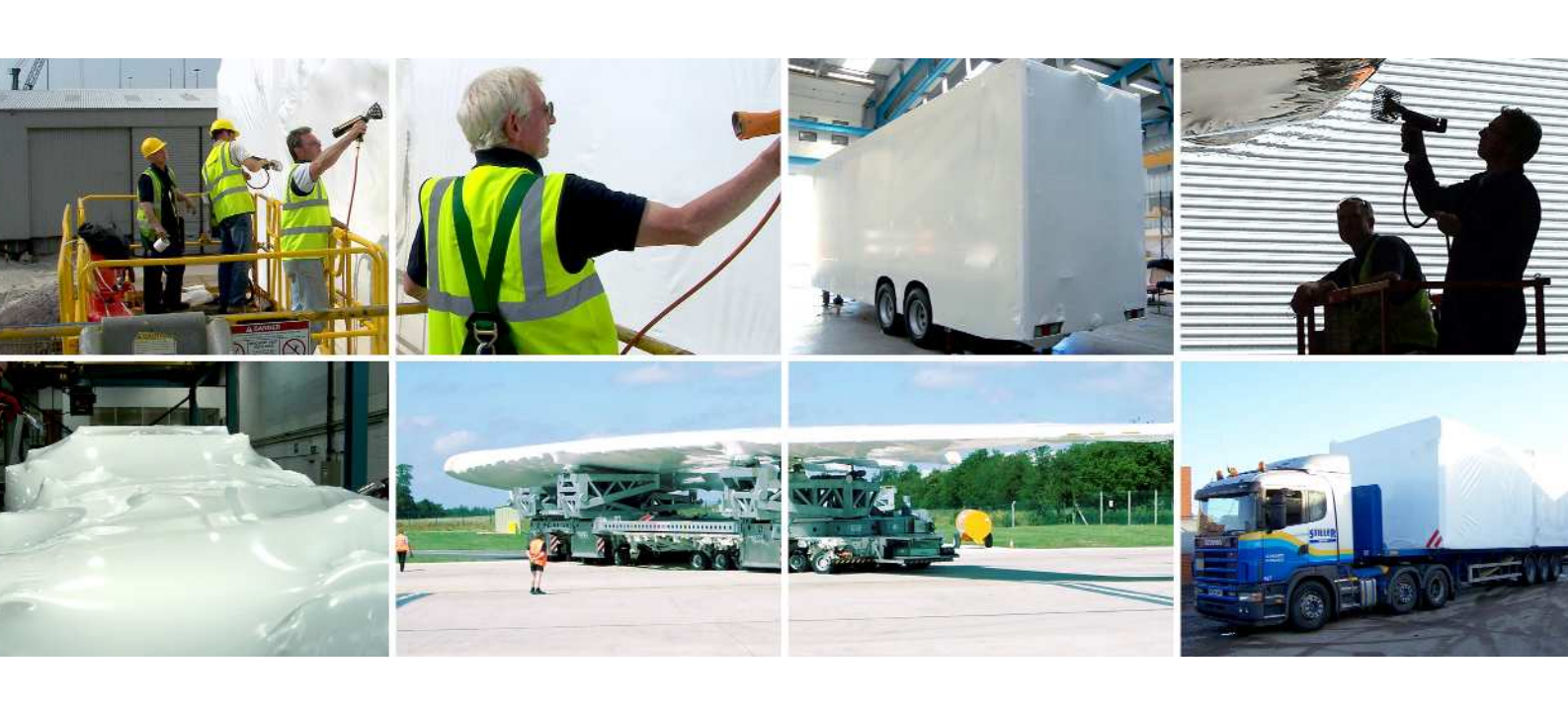
SHRINK-TO-FIT COVERS & INDUSTRIAL SHRINKWRAP